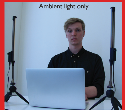
Ambient light only