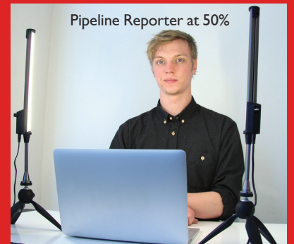
Pipeline Reporter at 50%