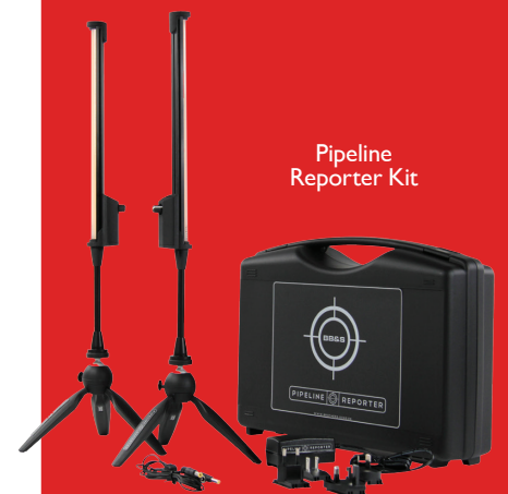
Pipeline Reporter Kit